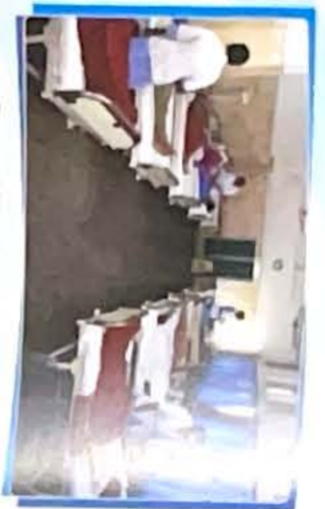
General Ward of the Hospital