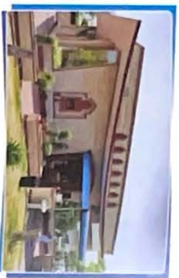
Sri Gurudwara Sahib

Academic Achievements : The students of the college have secured meritorious positions & the overall results have been excellent in university examinations.