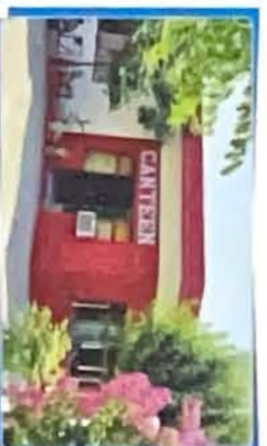
Refreshing Spot - The Canteen

Canteen : The institution has a hygienically maintained canteen which serves to the taste of the students, teachers and the visitors. The students enjoy their free moments with snacks, tea and cold drinks, thereby creating the fine blend of energy and refreshment.