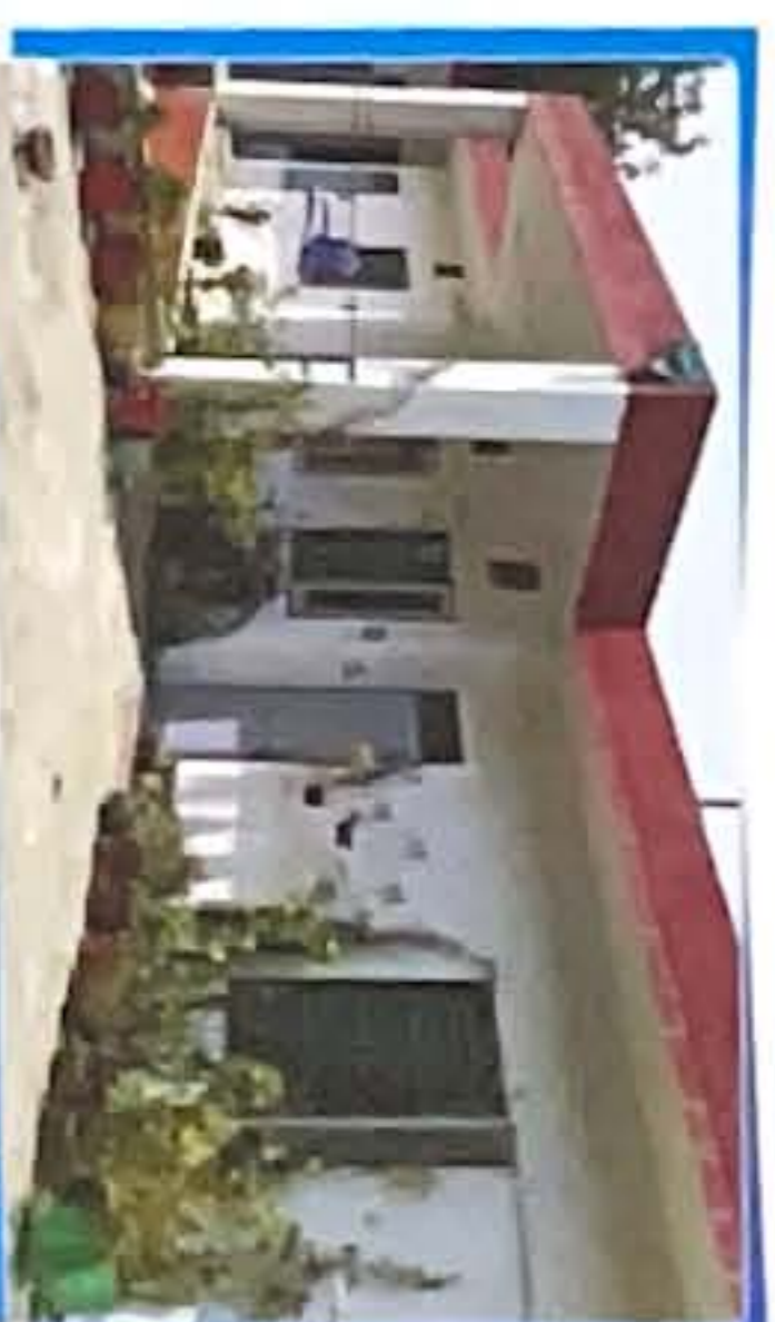
Staff Residential Complex

There is a well furnished examination hall.