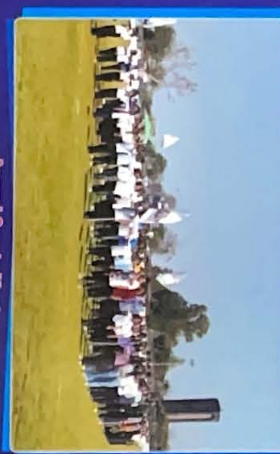
Annual Sports Meet