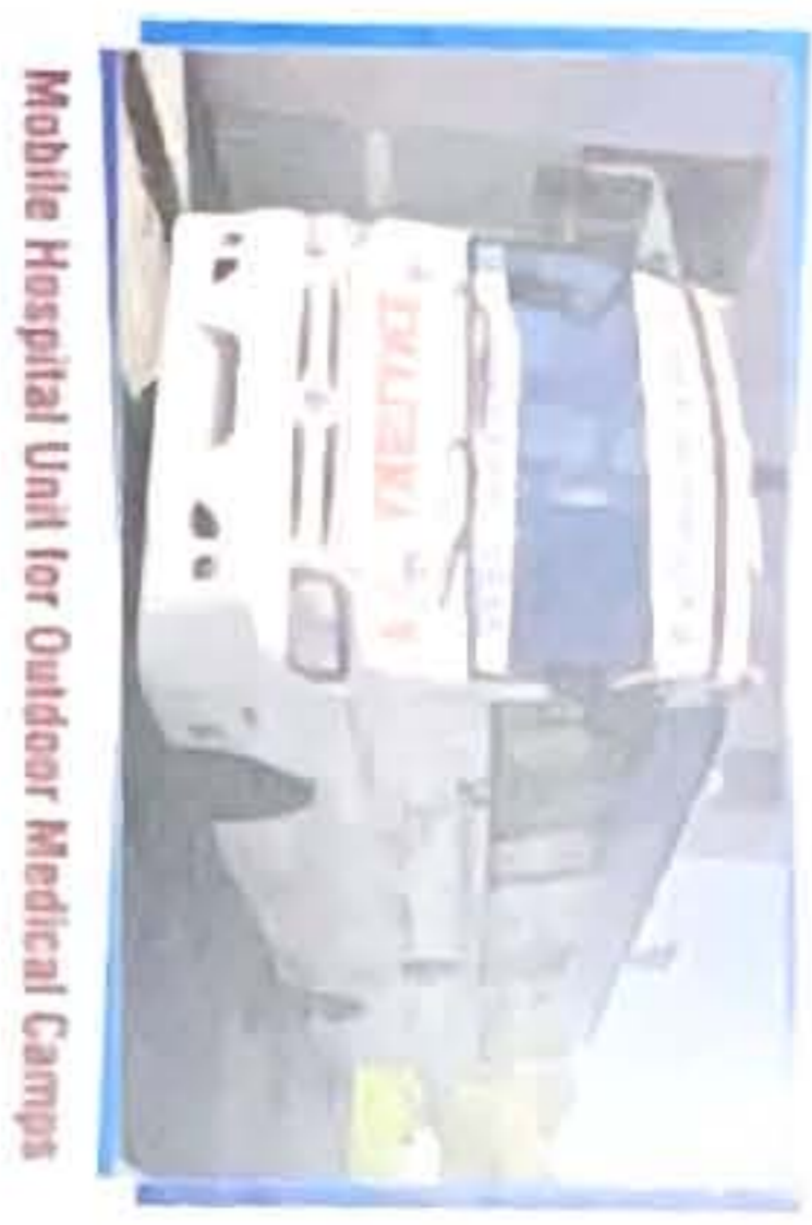
Mobile Hospital Unit for Outdoor Medical Camps

Free and Concessional Treatment On the humanitarian grounds the hospital trust always try to help the poor patients by giving very good medical treatment at concessional rates. The collective discount given to the poor patients comes out to be in thousands. Apart from providing medical services to the patients the hospital is also a source of employment for many people of the area. The staff of the hospital constitutes more than 100 employees.