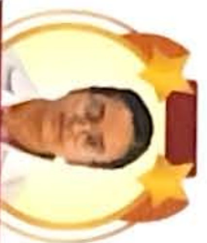
MONEY UNIVERSITY RANK 2