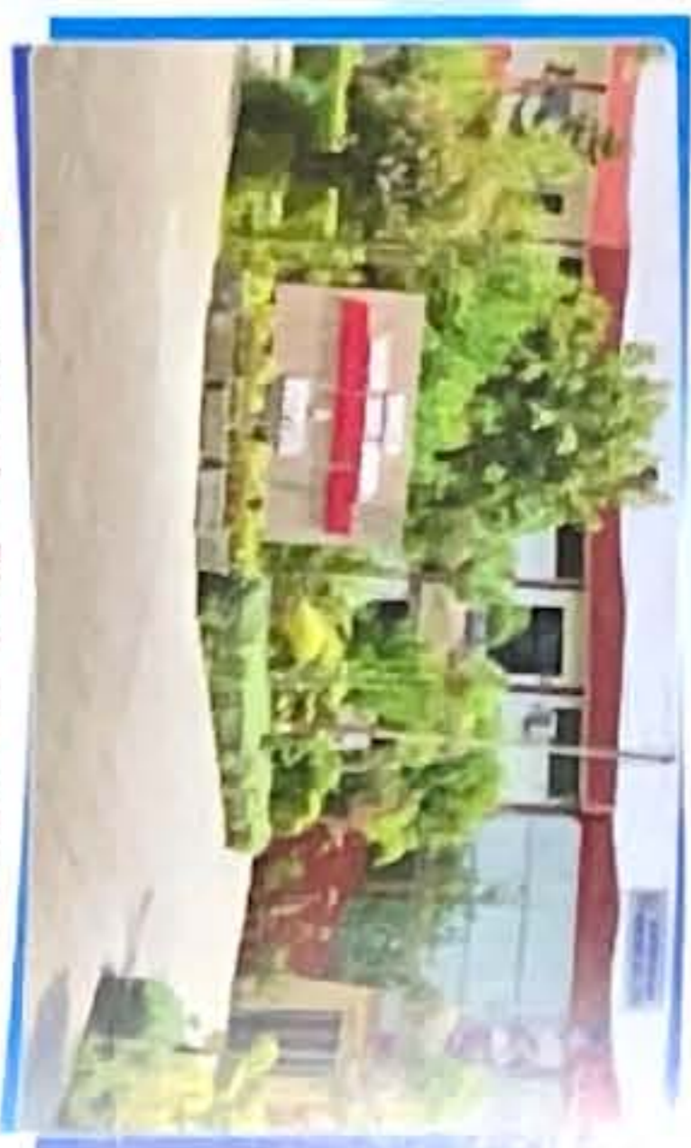
Administrative Block of the College

SKSS Ayurvedic Medical College, Sarabha is dedicated to the Great Martyr Kartar Singh Sarabha who sacrificed his life in the prime of his youth for the freedom of India. SKSS is a reputed institution situated in his native Village Sarabha (Dist. Ludhiana), Punjab. This college is recognised by NCISM, New Delhi & AYUSH a body of Govt. of India & affiliated with GRAU, Hoshiarpur Punjab. It's one of the most prestigious Ayurvedic College in the state of Punjab and providing the best Ayurveda Education & treatment facilities. The institute has a beautiful magnificent building and an eye catching landscaping view with a fine blend of architecture and natural outlook.