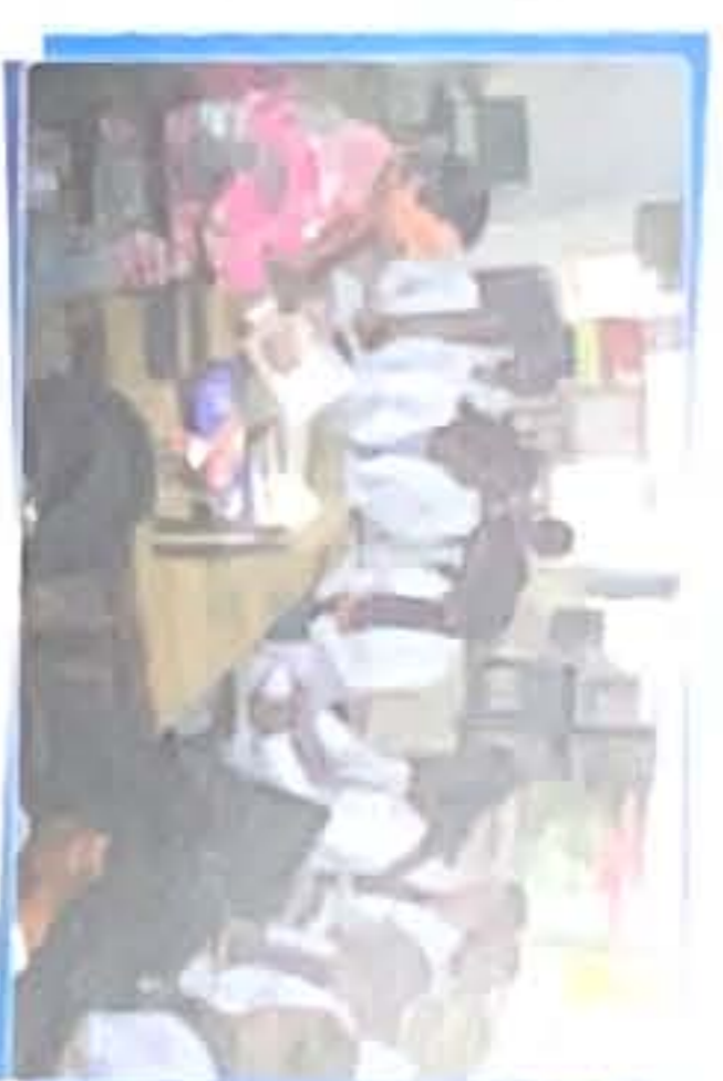
Samhita Siddhant Department

This is the first and most important department of Ayurveda, also known as Basic Principles. The department is concerned with Basic Principles of Ayurveda which are described in classical texts, i.e., Samhitas. As Samhitas are in Sanskrit which is a divine language, hence to understand Samhitas and to read in between lines Sanskrit is also taught by this department.