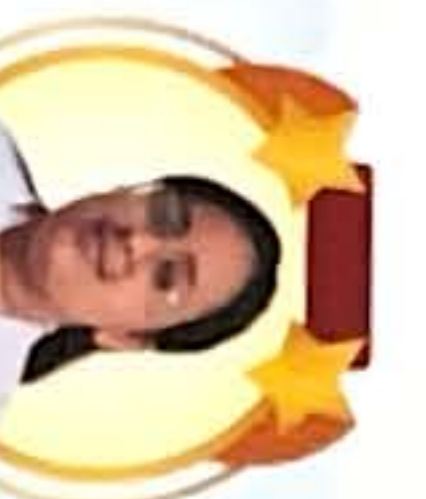
KURNIKA UNIVERSITY RANK 11